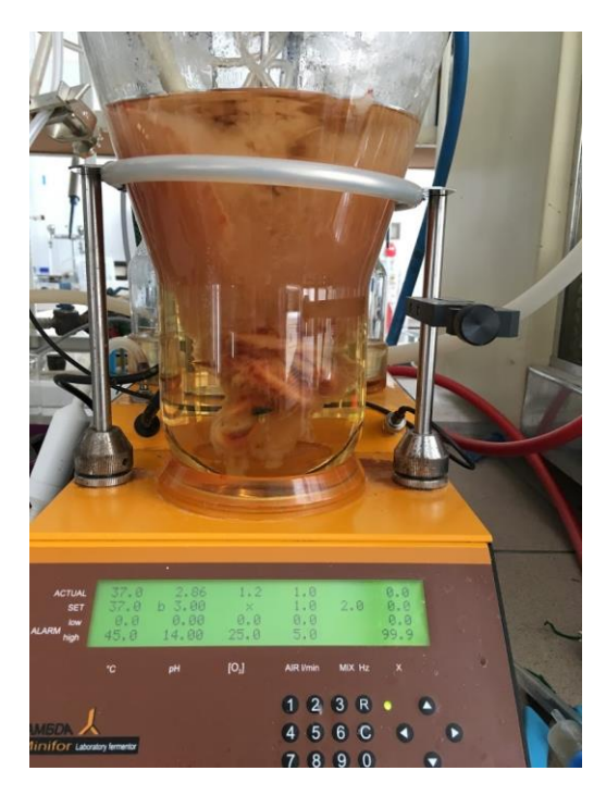
Figure 1: Itaconic acid fermentation

In the third year of the project further experiments for itaconic acid production were carried out to determine the optimal range of the operational parameters using the Aspergillus terreus NRRL 1961 strain. The fermentation was conducted in the Lambda Minifor bioreactor (Figure 1), its volume was 1.8 l, in batch mode of operation, using 120 g/l initial glucose concentration, with 5 % inocula, applying the suitable aeration described earlier. The concentration of acid formed was determined by HPLC. The fermentation process was evaluated from kinetical points of view, as well, the length of lag phase and the maximal yield were determined as 1.52 day and 3.83 g/l.day, respectively.